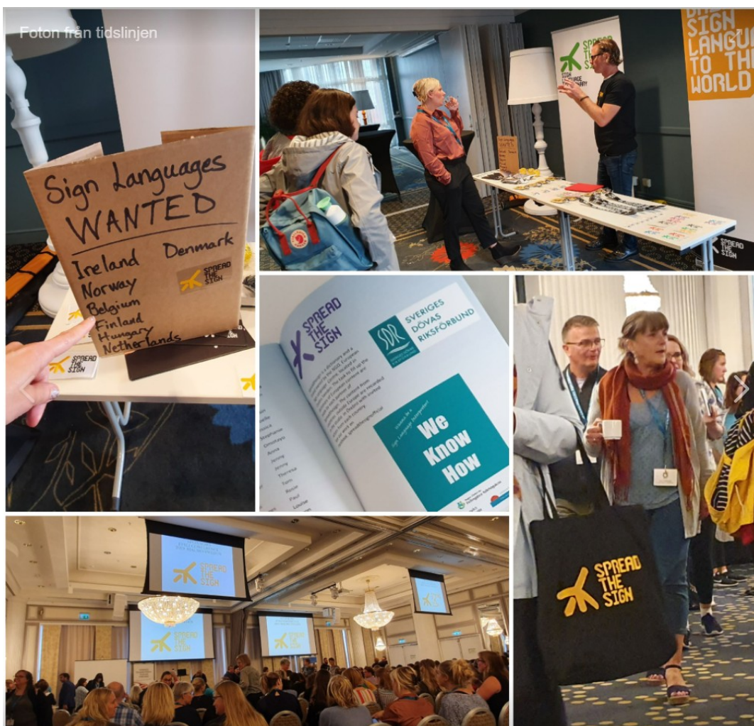
EFSLI conference in Malmö in September 2019