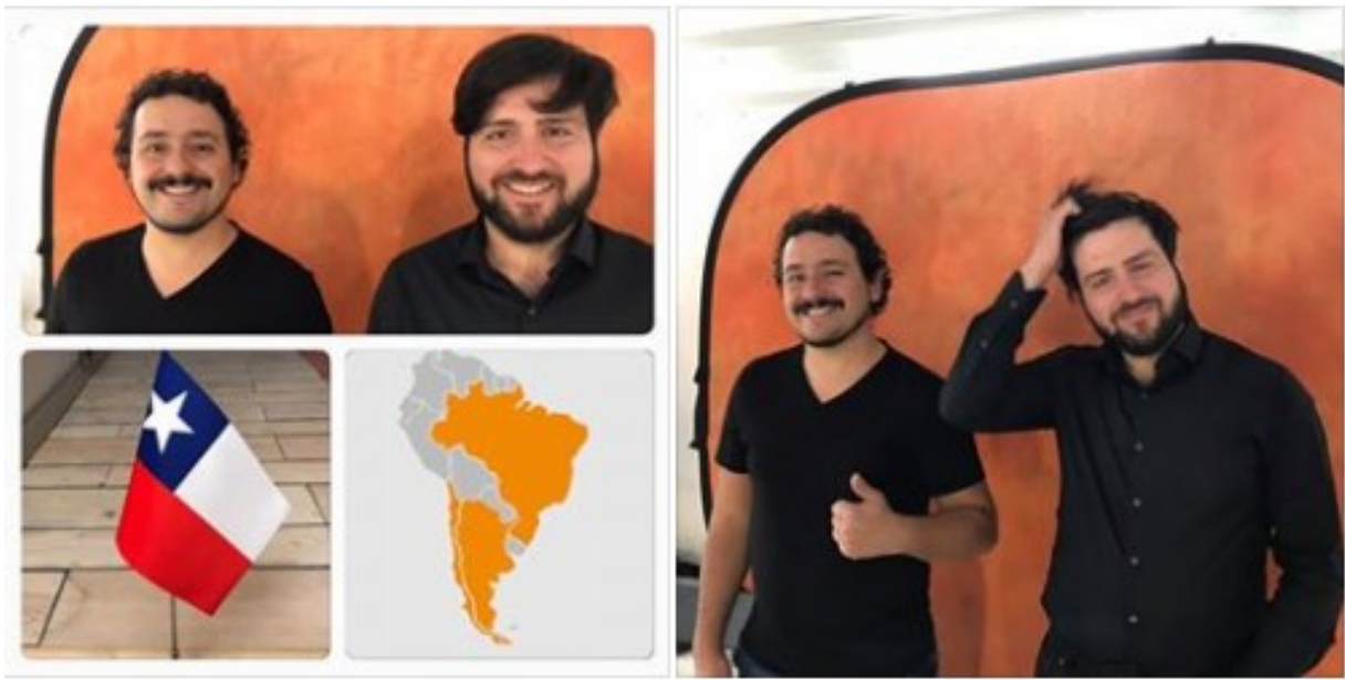
Our two actors from Chile in our studio in May 2019