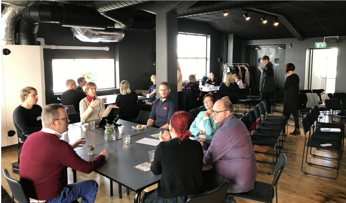
Dissemination meeting in Örebro September 2018