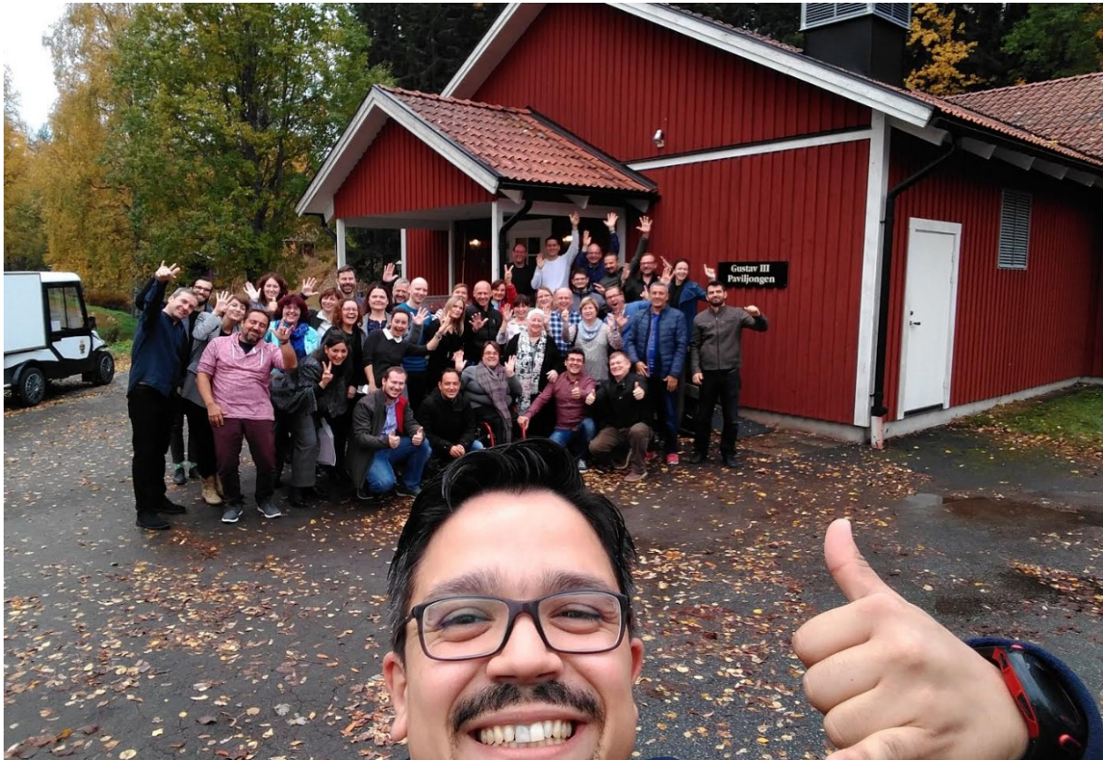
Loka October 2018