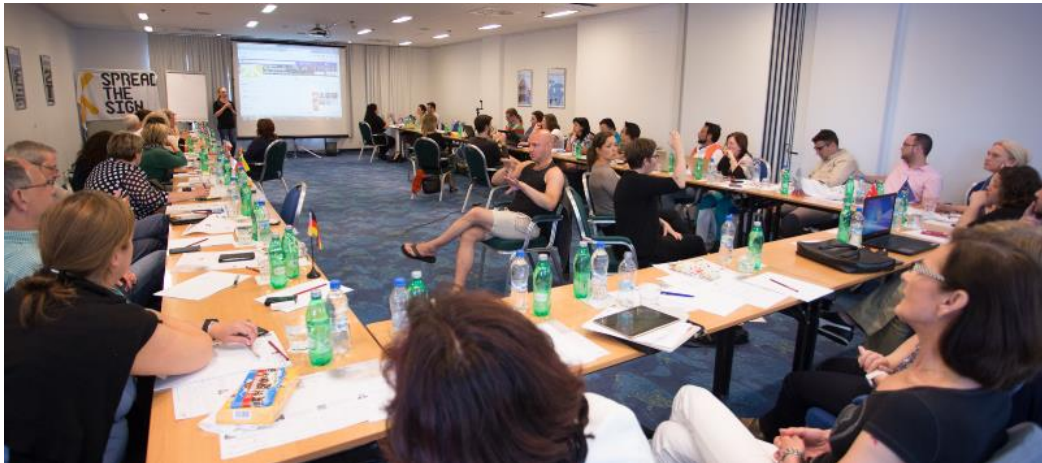
Picture from our meeting in Zagreb.

Production-wise, there are now over 310 000 signs in spreadthesign.com and the number gets higher.